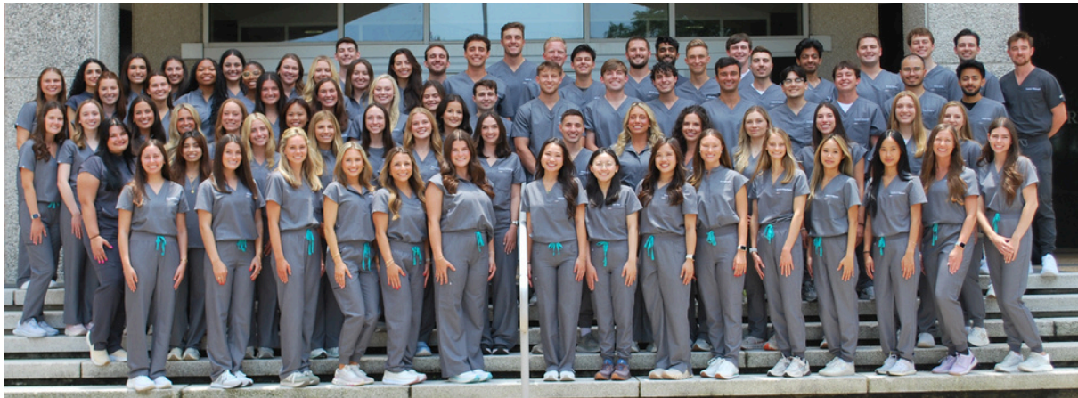
Doctor of Dental Surgery Class of 2029

The School of Dentistry is buzzing with excitement as a new academic year begins. We're proud to welcome our newest students to campus and look forward to watching you grow, learn, and thrive throughout your journey here. Best wishes for a successful and rewarding year ahead!