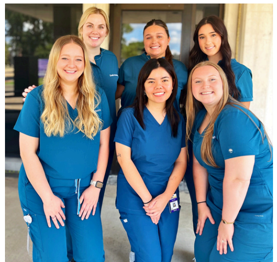
Dental Hygiene (Alexandria) Class of 2027