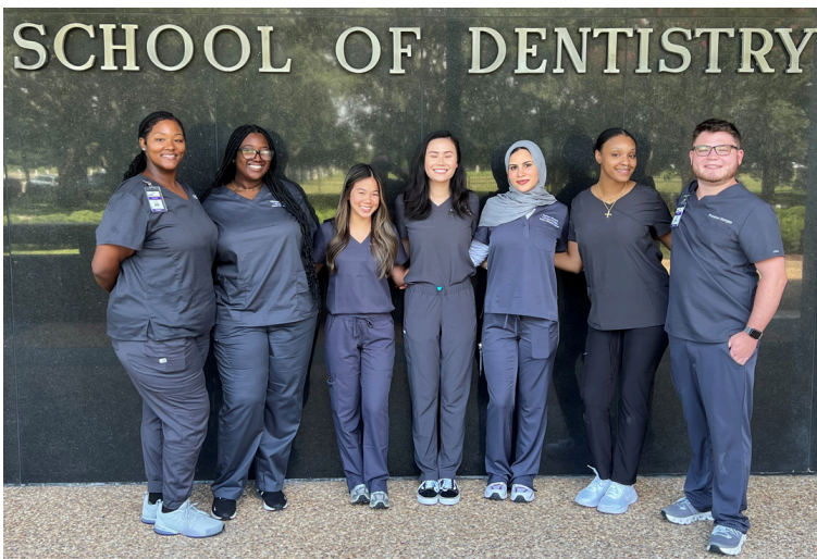
Dental Laboratory Technology Class of 2027