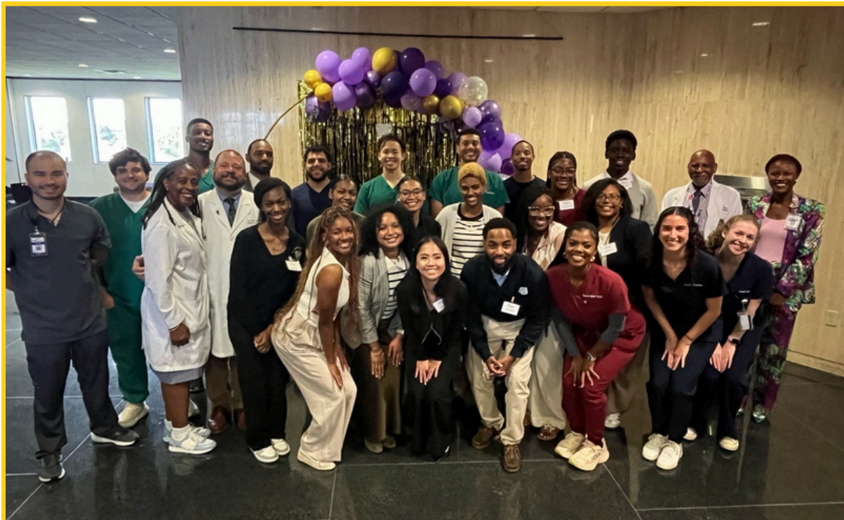
Pictured: Summer Enrichment Program volunteers & attendees