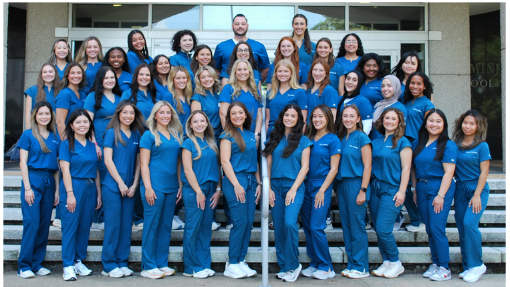
Dental Hygiene (New Orleans) Class of 2027